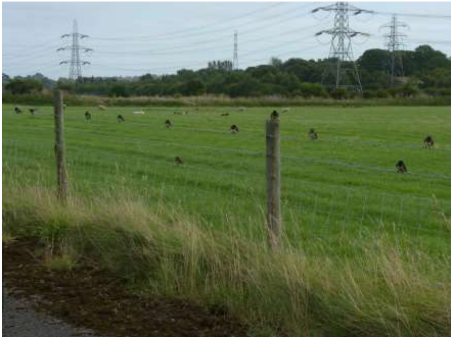
Swallows on migration near the road to West Hide

(With plant/butterfly data from Christine Hamer and Mary Wright)